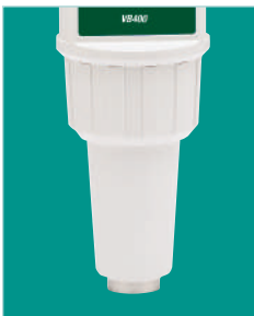
Magnetic base included