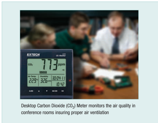
Desktop Carbon Dioxide (CO 2 ) Meter monitors the air quality in conference rooms insuring proper air ventilation