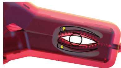
Megger clip being tested with IEC standard test finger for creepage and clearance.

Moving jaw fingers maintain the clips touch proof safety when the clip is closed but flex back to allow the metal teeth of the clip to contact test piece unimpeded when in use.