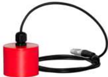
TEV Loc sensor TEV C900