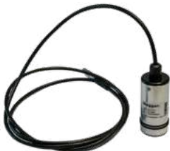
Acoustic-contact probe ACP30-1