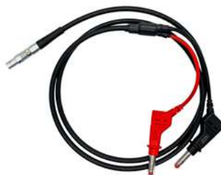
VK 155 LRHR cable