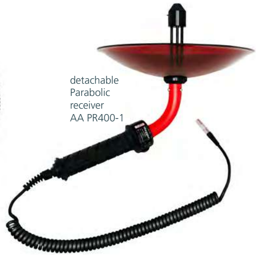
detachable Parabolic receiver AA PR400-1