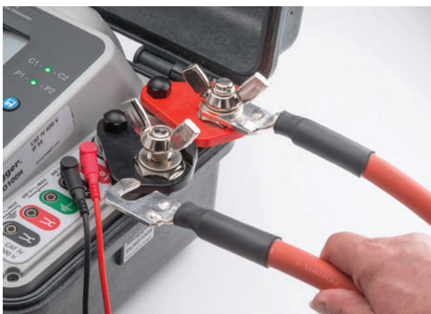
A new terminal adapter has been designed to enable the use of users own test leads.

DualGround™ capability with the DC clamp