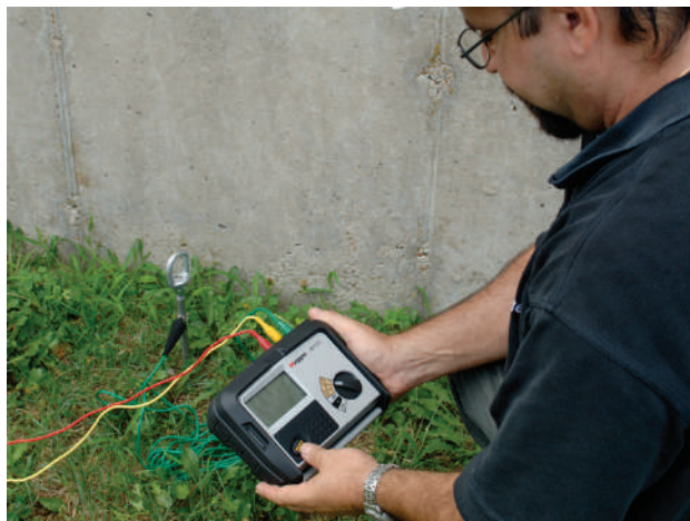
Model DET3TC shown performing the classic fall-of-potential test method.