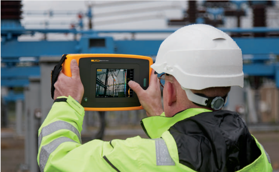
Image taken of the ii910 Precision Acoustic Imager detecting partial discharge in a high voltage application.