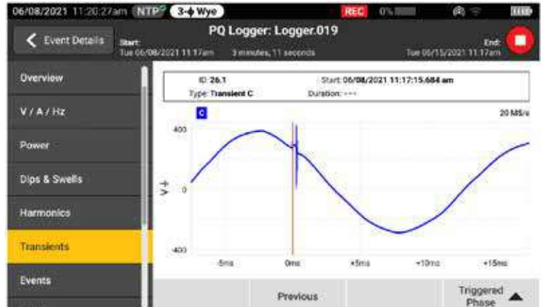
View real-time voltage transitory events while logging for faster troubleshooting

Transients negatively impact otherwise healthy systems every day and their potential to damage your equipment can't be underestimated. Whether your system is experiencing impulsive or oscillatory transients, the results can be devastating and cause problems ranging from insulation failures to total equipment failures. The Fluke 1775 and Fluke 1777 incorporate advanced transient capture technology to help you clearly identify high-speed voltage transients, so you have the data you need to stop them in their tracks. The Fluke 1775 Power Quality Analyzer has 1MHz sampling capability to capture fast transients, while the Fluke 1777 Power Quality Analyzer has 20MHz sampling capability to capture the fastest transients in high detail.