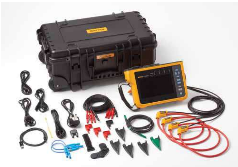
Fluke 1777 Power Quality Analyzer. Note: Included items vary by model and are listed in the “Ordering information” table.