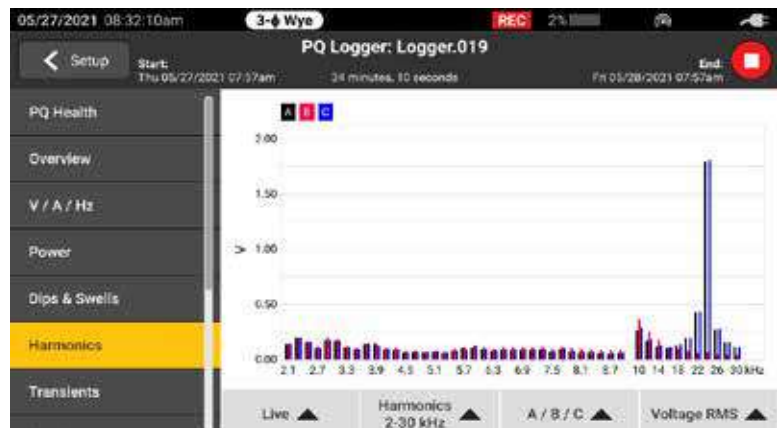
A full range of harmonics are available from the first 50 integer harmonics and from 2 kHz to 30 kHz

The Fluke 1770 Series was designed to be safe and easy to use in any measurement environment. The 1770 Series allows you to capture a full range of power quality variables as well as high-speed waveforms, high-speed transients, and higher frequency harmonics, all of which are instantly viewable on the large, high-resolution screen. With a best-in-class CAT IV 600 V / CAT III 1000 V overvoltage rating, these analyzers can be used at the service entrance or downstream, measuring AC and DC inputs, and harmonics measuring up to 30 kHz. With the 1770 Series you can be confident that you'll capture the data you need to make better maintenance decisions no matter the task.