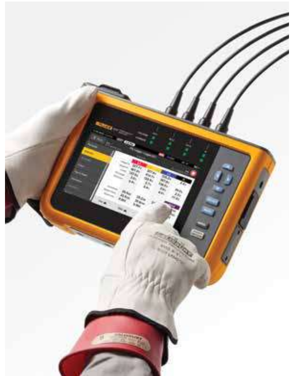
Easily navigate using the large color touchscreen

When downloading data from the Fluke 1770 Series Power Quality Analyzers the included Energy Analyze Plus software package can compare measured voltage and current harmonic statistical data to different standards, like EN 50160 or IEEE 519, to determine if they exceed compliance limits. This powerful predictive maintenance feature enables current harmonics to be observed before distortion appears in the voltage allowing you to prevent unexpected failures or non-compliance situations and increase system uptime. With the proliferation of inverter-based loads and power generation, keeping current harmonics in check is becoming increasingly critical to ensure reliable power quality and avoid system downtime.