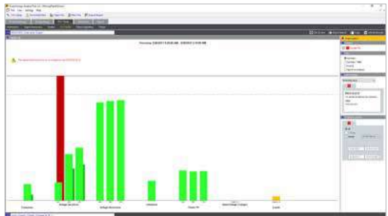
Fluke Energy Analyze Plus: Power quality health summary