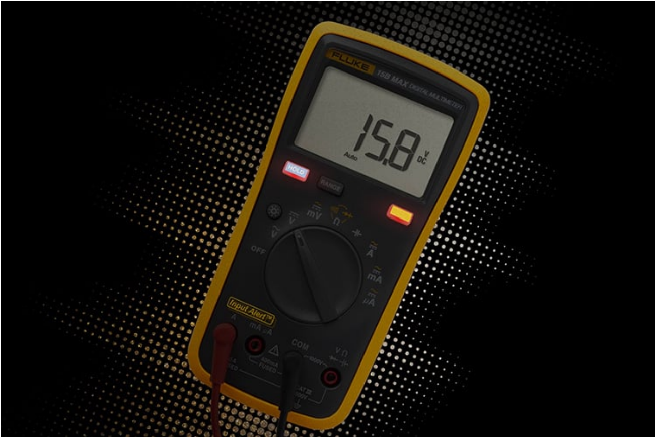
Audible and visual alarm for incorrect connections